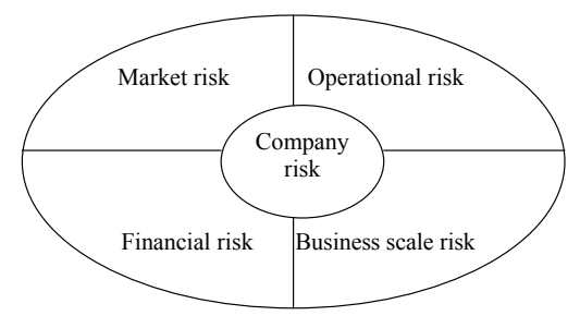
Fig. 1. Risks classification of a company – financial supermarket

In present conditions the main types of risks emerging in the process of financial supermarkets activity are market risk, operational risk, financial risk and business scale risk (Fig. 1).