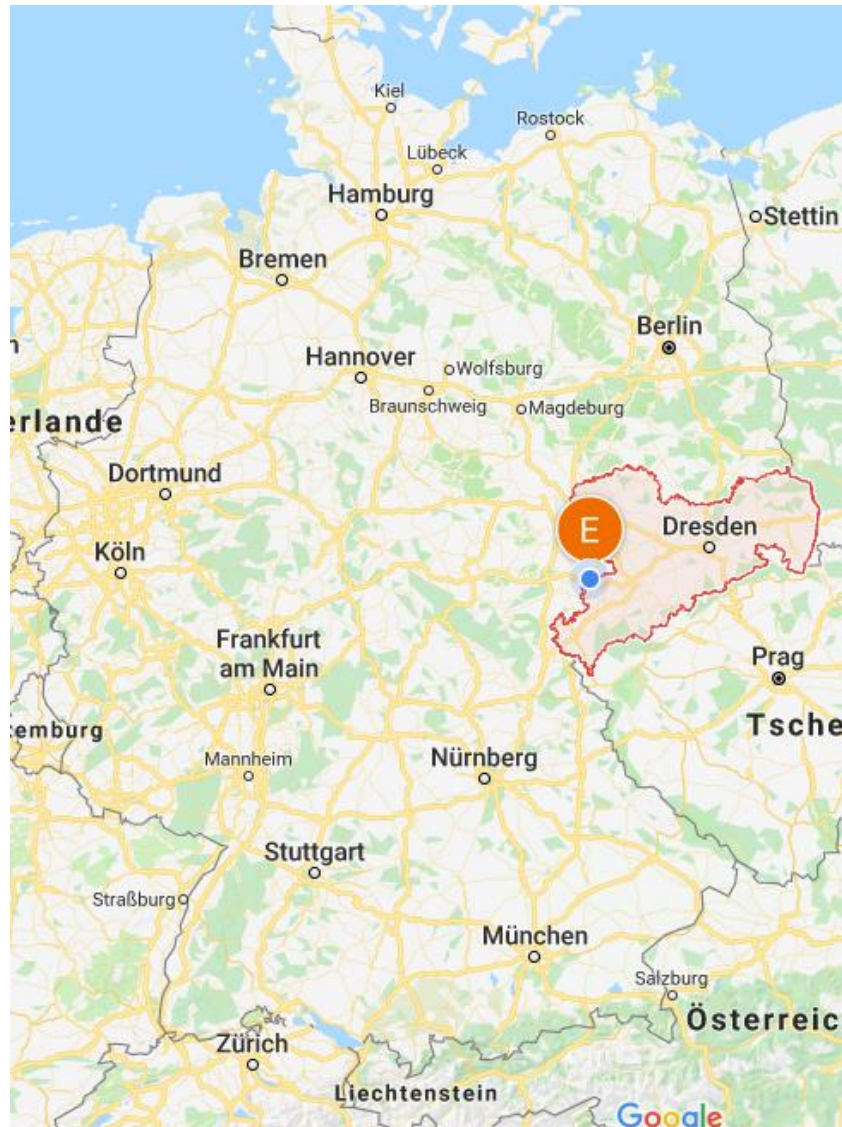
Figure 2. Graphic Location Saxony in Germany