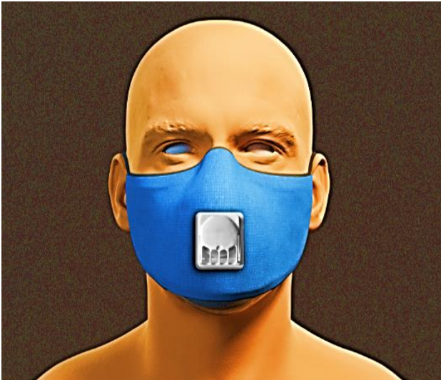
Figure 3 – The designed mask with a single filter

To guarantee a more secure mask fixation, its version with ear hooks like those used in glasses is proposed. Variants with separate filtering elements are presented in Figure 3 (a single filter) and Figure 4 (a double filter).