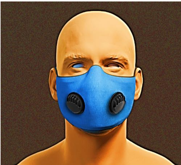
Figure 4 – The designed mask with a double filter

To guarantee a more secure mask fixation, its version with ear hooks like those used in glasses is proposed. Variants with separate filtering elements are presented in Figure 3 (a single filter) and Figure 4 (a double filter).