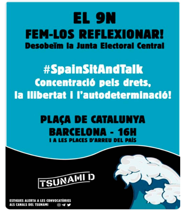
Figure 1 – One of the demands of the "Democratic Tsunami" movement

These goals caught the attention of the famous football coach Pep Guardiola, who is also a popular supporter of the Catalan independence movement. Among other things, he agreed to take part in a video produced by the "Democratic Tsunami". It was posted on X and shared on other social media platforms. The football coach criticized the decision of the Spanish Supreme Court and asked the international community to help resolve the conflict between Catalonia and Spain. "There is only one path sitting down and talking, sitting down and talking", he stated [18]. The video was in English and included Catalan as well as Spanish subtitles for greater distribution. Such a tactic, namely the support of a celebrity like Guardiola, could convince ordinary people that their participation in the movement is the right decision. As a result, the video was viewed around 1.33 million times as of 28 December 2019. Four years later, this statistic disappeared. Either the movement tried to hide them in order to avoid prosecution, or the technical features of the social