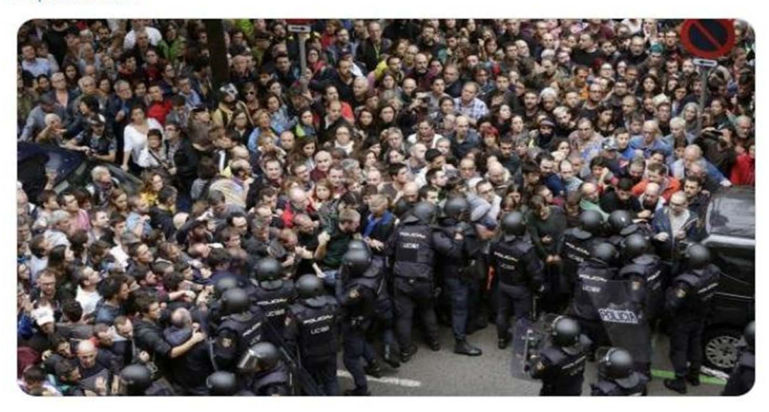
Figure 3 - Portrait of the police according to the frame of the "Democratic Tsunami"

Quan surti la sentència tornarem a fer un #TsunamiDemocràtic С