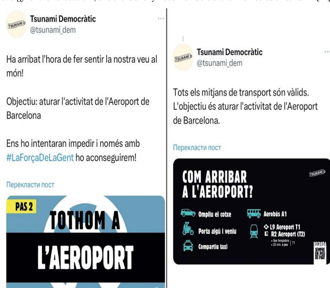
Figure 2 - An example of mobilization for an event

tasks provided the movement with a new impetus. Daily rewards in the form of accomplished goals gave the feeling of a small but victory, useful participation and readiness to move on. "Probably, the most difficult is the time when the actions end because many people feel that they still have energy to withstand in the action more. But the key to success is to reserve this energy for the next action", one of the anonymous members of the "Democratic Tsunami" [21].