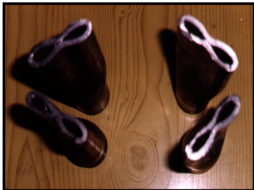
Figure 2 - Typical Post-buckling Configurations in Case of Plastic Collapse (A and X70 steel pipe specimens after sectioning)