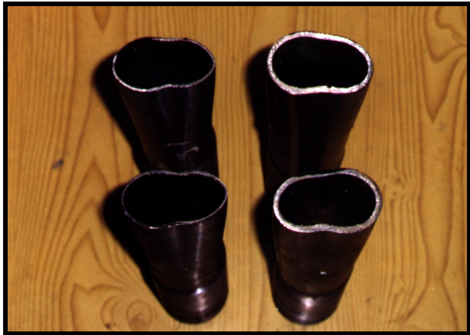
Figure - 3 Typical Post- buckling Configurations in Case of Elastic-Plastic Collapse (X52 and X56 steel pipe specimens after sectioning)