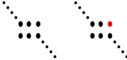
Fig. 1 – A pure and doped nano cluster with 6 point between two electrodes

We consider a typical nano cluster with 6 atoms and attach the left and right electrodes to the cluster, as shown in Figure 1 . At first the transport in a pure and doped cluster in a one-particle approach has been investigated. The total Hamiltonian of the above system contains the Hamiltonian of isolated cluster, electrodes and the interaction between them.