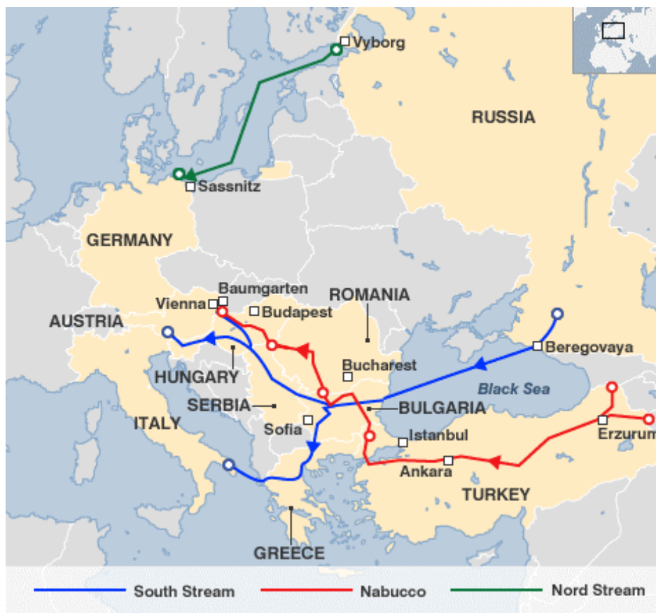
Fig. 1. Projected routes of Nord Stream, Nabucco and South Stream pipelines

Recently two Baltic States – Lithuania and Estonia – initiated some activities in order to decrease monopoly power of the Russian natural gas monopolist “Gazprom” within the so-called Third EU Energy Packet. Estonia’s Prime Minister argues that measures directed towards liberalization of energy markets of these countries and competition can be the «... attempts to persuade Eesti Gaas share holders to willingly refuse main gas pipelines, otherwise «other measures» down to nationalization of pipes» are possible (Эстония, 2011).