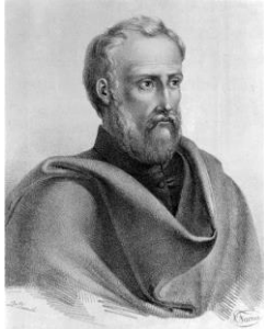
Fig. 2 - Giovanni Battista Canano

important contribution by Canano was the first public demonstration of venous valves performed in 1547 [5, 8].