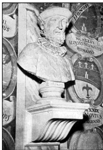
Fig. 3 - Giulio Cesare Aranzi

Giulio Cesare Aranzi (Fig. 3) graduated from Bologna in 1556. The same year, Aranzi became professor of surgery and anatomy at the University of Bologna. Aranzi began as a lecturer in surgery and in 1570 he was able to have 2 subjects, surgery and anatomy, separated, so that each would have its own professorship. He was the first lecturer at the University of Bologna to hold a separate professorship of anatomy. He held both positions for 33 years until his death in 1589 [9, 10].