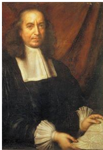
Fig. 6 - Marcello Malpighi

He is regarded as the founder of microscopic anatomy and may be regarded as the first histologist [17-20]. In 1661 he identified the pulmonary capillary network, proving William Harvey's theory on blood circulation. He discovered the taste buds and was the first to see red blood cells and realize that they gave blood its color. Malpighi first demonstrated the lymphatic follicles in the spleen and described the renal glomerular capillaries, both of which bear his name. He demonstrated that bile is secreted by the liver, not the gall bladder. The great Swedish botanist, Linnaeus named a genus of plants after Malpighi, the Malpighiaceae.