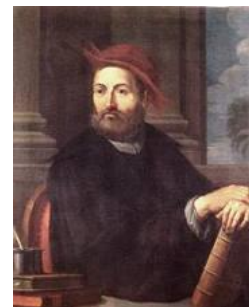
Fig. 5 - Andrea Cesalpino

One of the founders of botany Andrea Cesalpino (1525-1603) (Fig. 5), also known as Caesalpinus, studied under Realdo Colombo and Luca Ghini in Pisa, where he received his degree in 1551. Later in 1555 he succeeded Ghini as director of the Botanical Garden of Pisa and as lecturer of medicine. Cesalpino was Chair of Medicine from 1569 to 1592, when he moved to Rome where he served as physician to Pope Clement VIII and taught medicine at the Sapienza University [15].