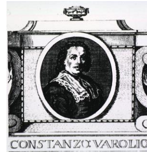
Fig. 4 - Constanzo Varolio

method he was able to observe several structures, including the hippocampus, the cerebral peduncles, and the pons [7, 12, 13]. Varolio rediscovered "Musculi erectores penis" (i.e. mm. bulbospongiosi and ischiocavernosi) and gave a correct description of the mechanisms of erection [14].