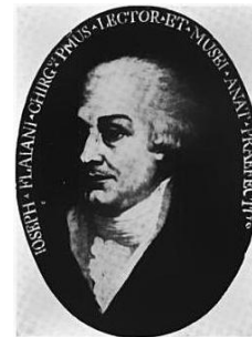
Fig. 8 - Giuseppe Flaiani

Last archiater among anatomists was famous surgeon and anatomist Giuseppe Flaiani (1739-1808) (Fig. 8). He studied at the La Sapienza University (Rome) and received his degrees on philosophy and medicine in 1761. He practiced as surgeon in Sassia. In 1775 he was appointed as surgeon of Pope Pius VI [25].