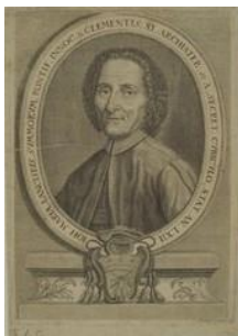
Fig. 7 - Giovanni Maria Lancisi

Well-known scientist and physician Giovanni Maria Lancisi (1654-1720) (Fig. 7) graduated from Sapienza University (Rome). In 1684 he was appointed Chair of anatomy at this university, a position he held for 13 years [11]. At the age of 34, Lancisi was selected by Pope Innocent XI to be his personal physician. When the Pope died in 1689, Lancisi returned to private practice and teaching. A decade later, Lancisi was again called to serve the Vatican. This time he was consulted in the case of Innocent XII for whom he cared until the Pope's death. His successor, Clement XI, also appointed Lancisi to the prestigious position of Physician to the Pontiff [21-23].