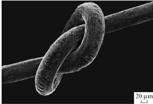
Fig. 1 – Image of the thick \text{Co}_{69}\text{Fe}_4\text{Cr}_4\text{Si}_{12}\text{B}_{11} microwire, illustrating its ability to tighten into a knot without fracture

tions are producing. Moreover, the glass shell in such wires is weakly adhered with the metallic core, and it can be removed easily. The wire core has the geometric parameters stable along its length, the smooth mirror surface almost without defects and very high, for amorphous alloys, plasticity level that is characterized by the ability of the wires to tighten into a knot without fracture (see Figure 1).