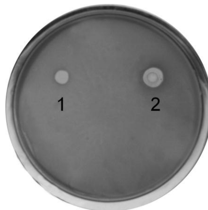
Fig. 1 – Effect of original polystyrene films (1) and modified one (2) on Staphylococcus aureus Rosenbach [2]

Thus, when developing a composite material, it should be taken into account that modification may improve some properties of the polymer but simultaneously deteriorate other properties. Therefore, studies aimed to elucidate the composition-property relationship and to reveal the optimal dopant concentration become very topical.