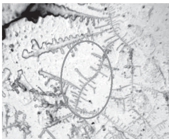
Fig. 1. Continuity of main body

For a complete quantitative characteristics of microcrystals we guided by proposed algorithm [4]. The general background of the agent was studied at low magnification (h40) and microcrystals -was studied at an average magnification (X100) [1]. A detailed description of crystalloscopic presentation was studied at high magnification (h400) according to the following criteria: continuity of main body ( Fig. 1 ), the connection of the first order sprout with the main body, the nature of branches tops - sharp or rounded ( Fig. 2 ), the width of the main body. Besides the description of microcrystals, organic inclusions were also evaluated ( Fig. 3 ): the ratio of their area to the field of view, location (on the periphery, in the centre or around the field); position towards a crystal (sticking or insulation).