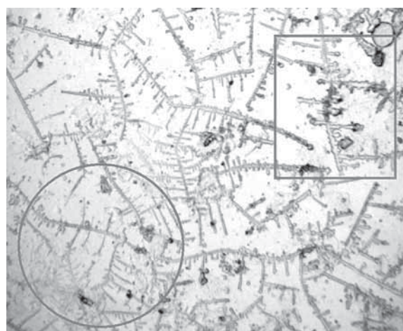
Fig. 2. The nature of branches tops - sharp (left) and rounded (right)