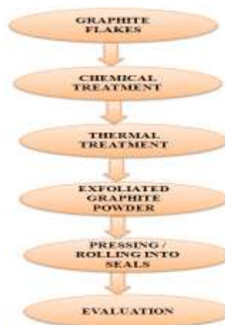
Fig. 1 – Process flow chart of exfoliated graphite product

The surface area of exfoliated graphite sheets has been obtained using (11-2370) Gemini, Micromeritics, USA, surface area analyzer at a regeneration temperature of 200 °C for 2 h with N 2 purging.