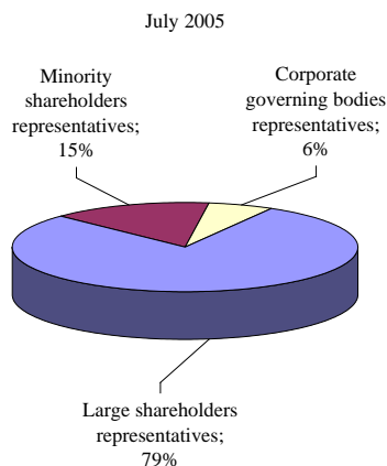
Fig. 1. The Ukraine supervisory board composition

Minority shareholders representation on the supervisory board is very interesting from the point of view of the type of the minority shareholder. As a rule, among 15 per cent of the members of the supervisory boards in Ukraine representing interests of minority shareholders there are only 2 per cent of members of supervisory boards who represent interests of outside minority individual shareholders. The rest minority shareholders representation belongs to other groups of shareholders who are minority shareholders in the certain ownership structure, i.e. employees and managers. From the point of view of the absolute representation on the supervisory board in Ukraine there is no dominative position of any shareholder. Thus, 42 per cent of members of the supervisory boards in Ukraine represent interests of large institutional shareholders including the national and foreign. Employee shareholders have 28 per cent of members of the supervisory boards. Executive shareholders have about 17 per cent of the supervisory board representatives. The rest belong to the state (about 11 per cent of the members of the supervisory board) and outside individual minority shareholders (2 per cent).