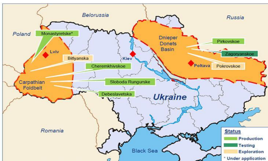
Figure 2. Natural gas fields in Ukraine

Today 13.8% of electric power is generated by nuclear power, and 50.06% in Ukraine (Jakovetz, 1984). By 2050 the world plans to increase the production of nuclear power in 1200 GW (by 24%) (Figure 2), which requires additional investments in infrastructure and personnel qualification, expansion of nuclear fuel supplies while maintaining high quality and safety standards (Tsikavyi, 2016).