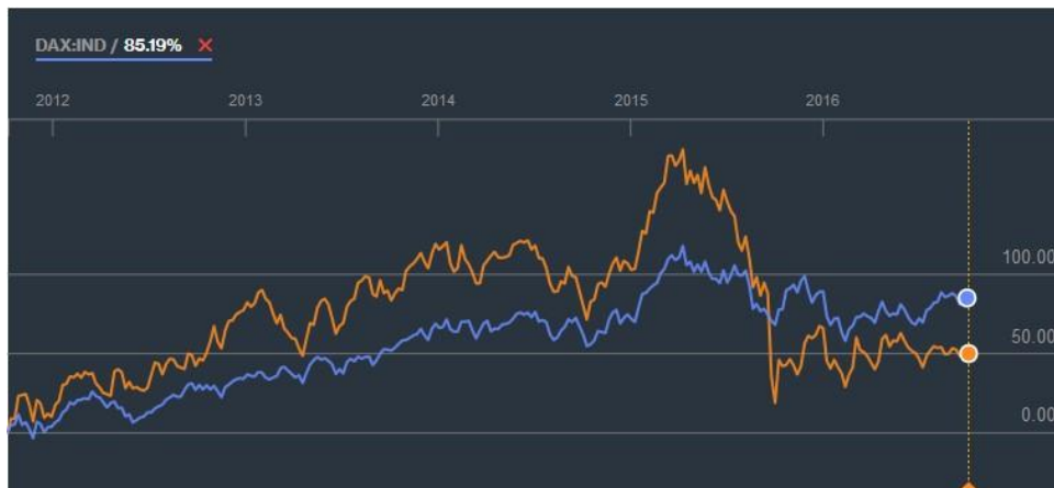
Figure 3. Volkswagen Group (orange line) historical stock price comparing with DAX index (blue line)

The drop in stock prices of the major auto industry companies clearly shows that after the VW confession, all market participants were suspected and that was the reason why investors were trying to sell out stocks of other car companies. VW has also lost its power in competition with other car brands. VW brand has become not that important as it was before, this came out in VW's market share lost. In 2014 VW took 12.41% market share, one year later – 12.04% and in 2016 market share decreased to 11.35% (Demandt, 2017). These numbers reveal how the loss of customers trusts could influence the size of the market share.