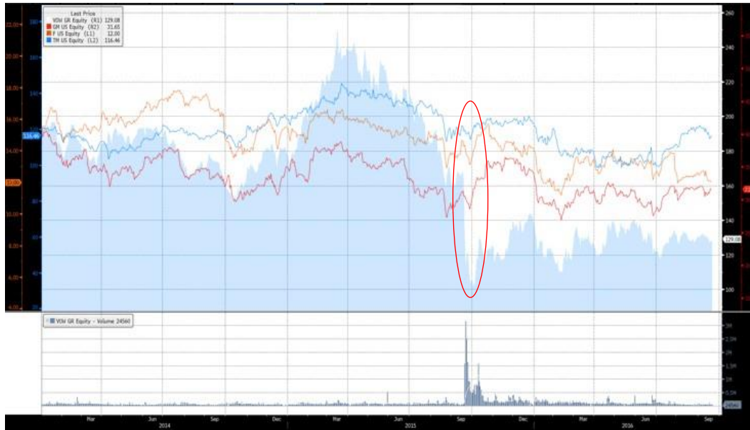
Figure 2. VW (blue shadow) historical stock price graph compared to Ford (orange), Toyota (blue), General Motors (red) stock prices