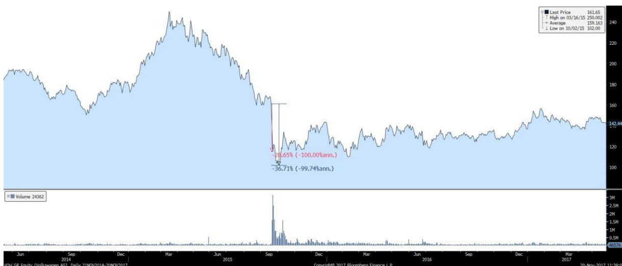
Figure 1. VW historical stock price graph

Respectively, this amount of trading also had an impact on the VW's stock price decreasing. In the first quarter of 2016, stock prices have been volatile based on the company's news (see Fig. 1). This scandal denied the myth that corporate profit and dividends are the most important objects to the company's shareholders, while social factors have no influence.