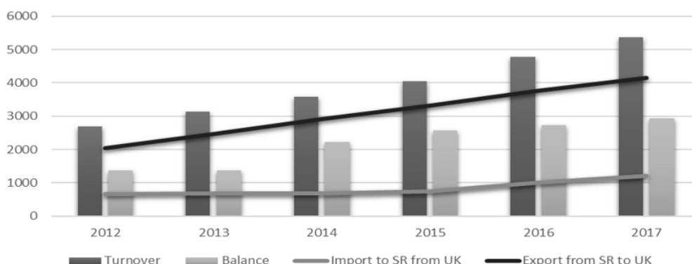
Figure 2. Slovak Foreign trade with Great Britain in millions of EUR in the period of 2012 to 2017

As shown in Figure 1, the share of Great Britain in Slovak foreign trade is relatively small and the UK is the seventh most important export partner for the Slovak Republic. In 2017 Great Britain accounts for 5.5% of Slovakia's total exports and 1.6% of Slovakia's imports. However, Britain's share of Slovak foreign trade has been growing rapidly in recent years. Figure 2 shows that exports are particularly successful, the pace of which is almost 2 times faster than the total export from Slovakia for the last 5 years. On the other hand, the growth of imports from the UK was similar to the growth of total imports in 2012 – 2017. Despite the relatively small share of total foreign trade, the trade balance of Slovakia with Britain for 2017 is the second largest (EUR 2.9 billion), just behind Germany.