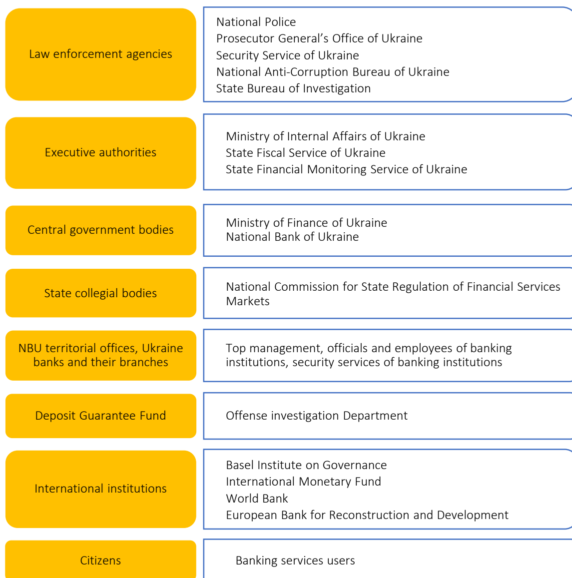
Figure 2. Entities of combating crime in banking in Ukraine