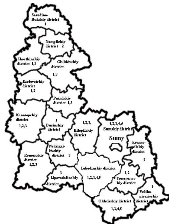
Fig. 2. Types of tourism characteristic for the Sumy region. Symbols legend in the figure 2: 1 – environmental tourism; 2 - ethnographic tourism; 3 - rout-cognitive tourism; 4 - sanatorium-recreational tourism; 5 – sport and recreational tourist, including: water, walking tours, sports fishing, hunting, equestrian and others.