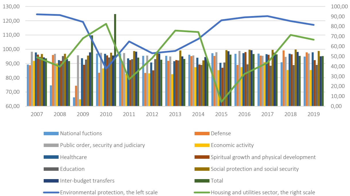
Figure 1. Execution of expenditures of Ukraine's state budget, %