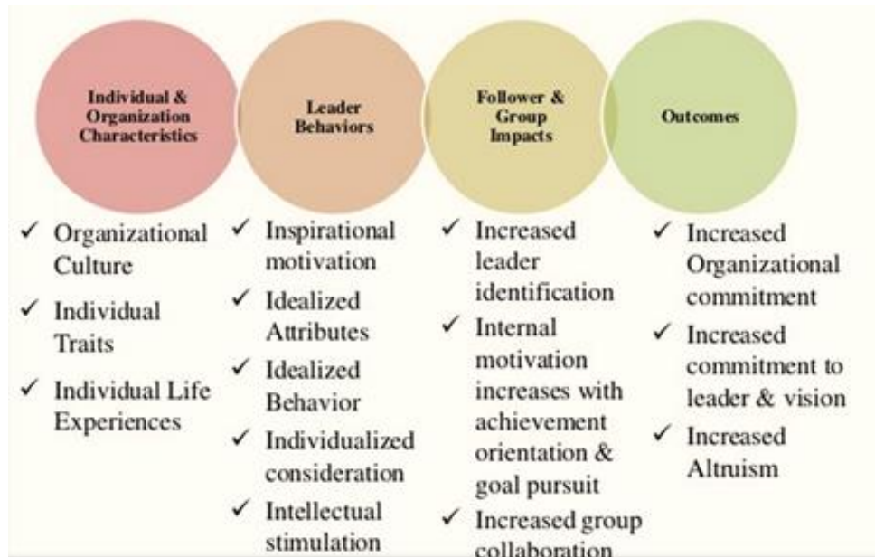
Figure 1. Transformational Leadership