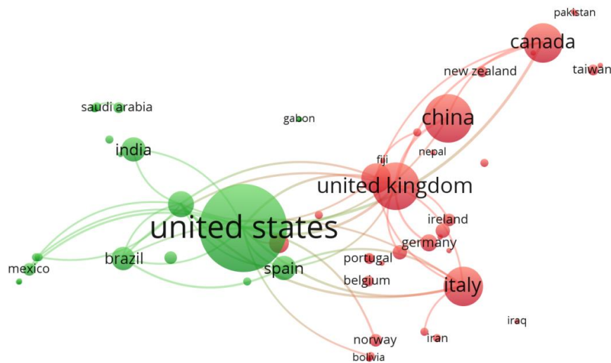
Figure 2. The territorial distribution of the use of the concept of “COVID-19” and related terms in publications is constructed using the VOSViewer 1.6.10 software