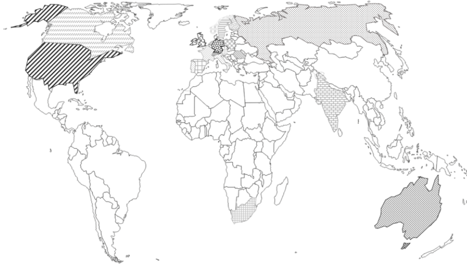
Figure 3. Geographical Locations of All Contributing Organizations