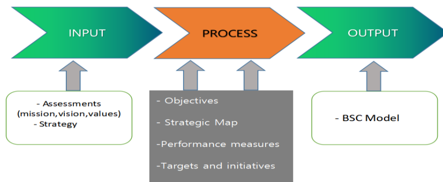
Figure 1. Balanced scorecard implementation Process.

In the course of our designing of the proposed model of the Balanced Scorecard for the Company of Algeria Post. We decided to follow a specific methodology to obtain the desired results. Given the governmental nature of Algeria Post Organization , We deemed it necessary to apply a Public Sector BSC Model , using a "top-down" principle of (Kaplan and Norton , 2014) combined with the implementation procedures described in the theoretical side by (Alain Fernandez, 2013). The figure below simplifies what we will discuss in this part.