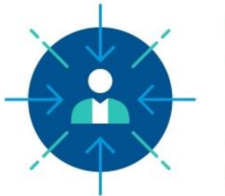
Figure 5. Customer-Centric Business Model