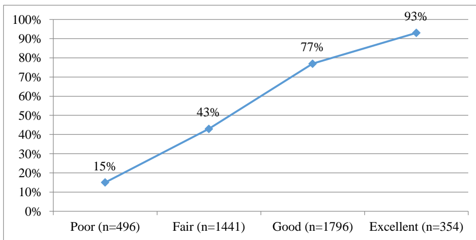
Figure 1. Correlation with Meeting Objectives

Let us discuss the correlations: The data points show who have achieved or exceeded their goals in each category of change management effectiveness. The below figures show how the effectiveness of change management is related to the achievement of the project goals.