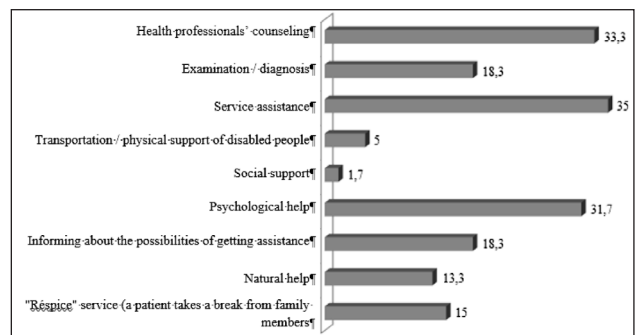
Figure 2. Types of services palliative caregivers require

health care, social protection, volunteer, public, and service organizations.