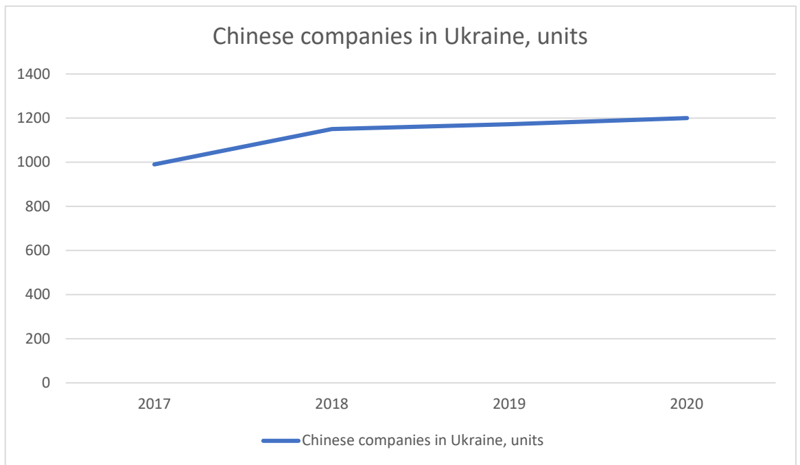
Figure 2.3 - Dynamics of the number of enterprises with Chinese investments, 2017–2020

In the period 2017-2020 on the Ukrainian market, Chinese and Ukrainian companies signed three agreements in the energy, metallurgical and banking sectors: