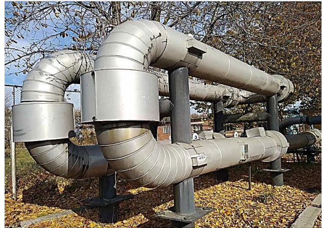
Figure 2 – General view of the calibrated area between detectors: Experimental setup

PPI, the ball piston completely covers the inner section of the PPI and moves with the fluid at a constant speed.