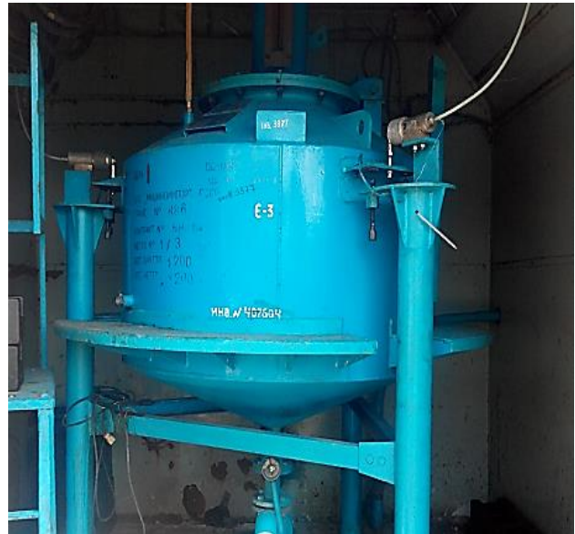
Figure 3 – Test installation (general view)