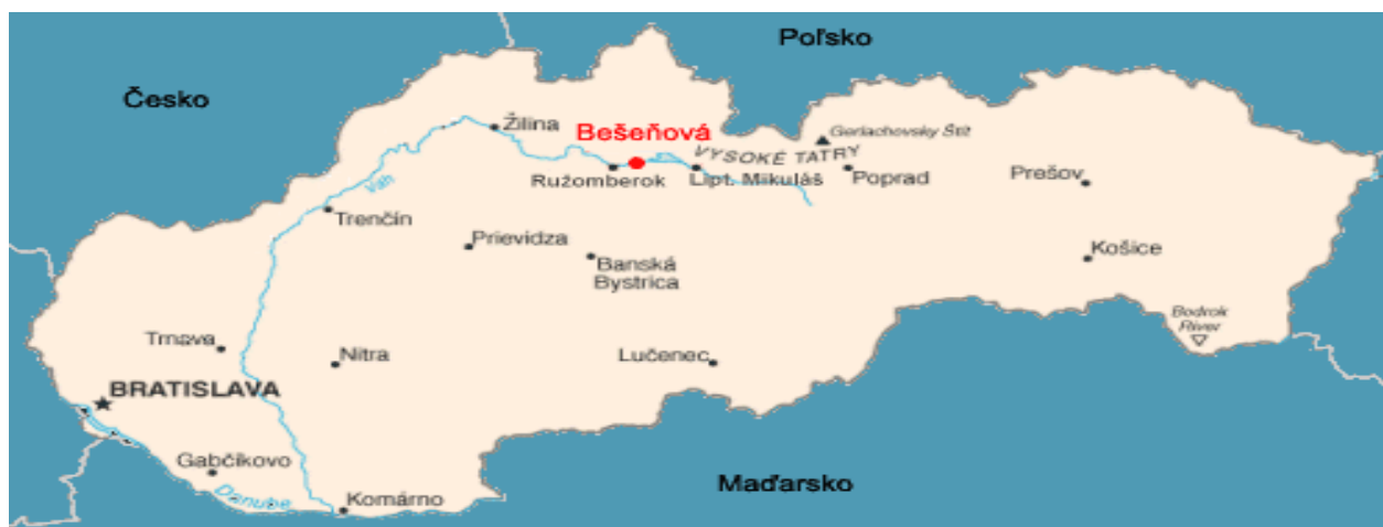
Figure 1. Location of the village Besenova on the map of the Slovak Republic

In the paper is attention paid to the analysis and perception of tourism in the local government of the municipality of Besenova, with an emphasis on the primary and secondary offer of tourism in the municipality, which largely influences the development of tourism in the entire Liptov region. The village of Besenova is located in the heart of the tourist-attractive Liptov region, whose natural diversity ranges from underground cave beauties to high peaks. Thanks to the ideal geographical conditions, the rich culture of folk folklore, or the unique architecture, it is one of the most popular holiday regions in Slovakia. Its location on the map of Slovakia is shown in Figure 1.