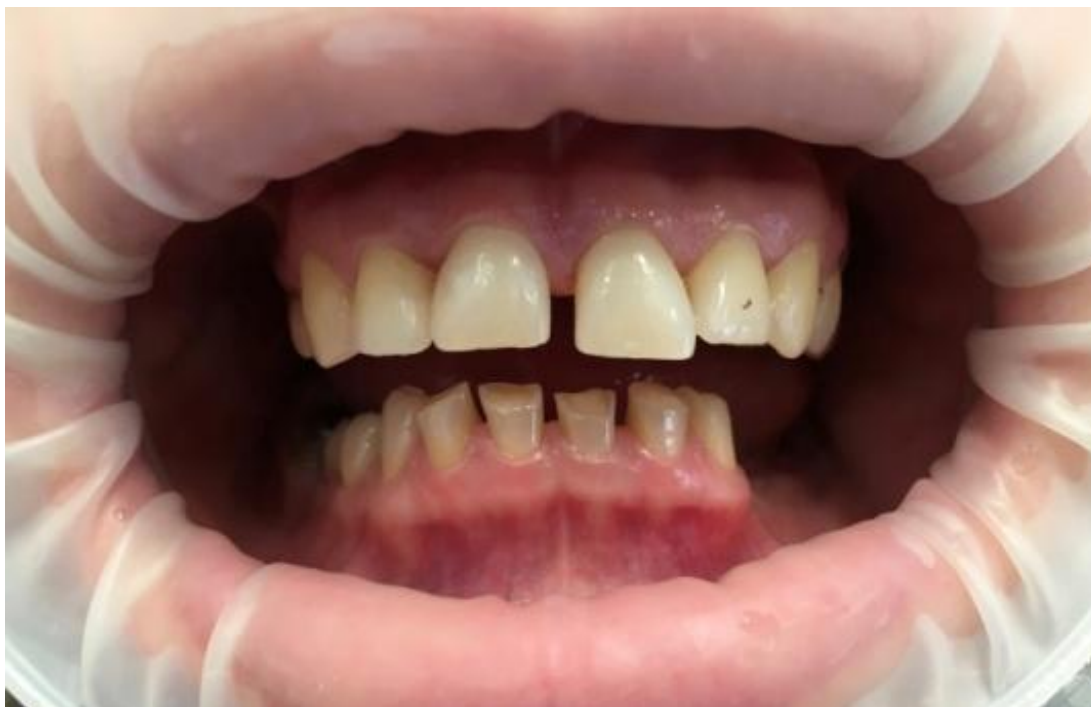
Fig. 1. The condition of the teeth in the oral cavity

area of masticatory muscles, absence and destruction of lateral teeth, difficulty in chewing food, mobility and displacement of individual teeth, periodic bleeding gums, as well as aesthetic disorders (figures 1–2).