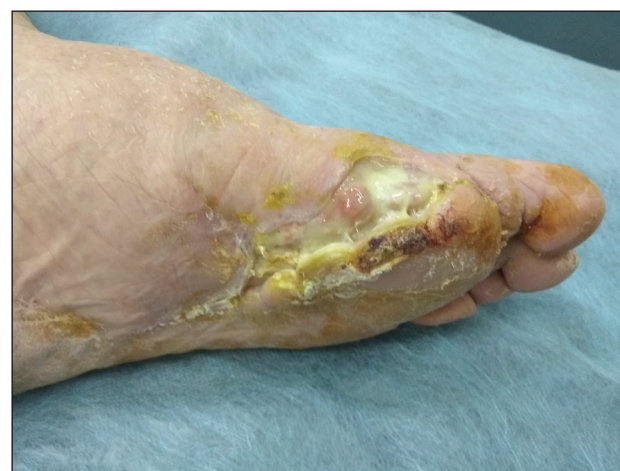
Figure 3. Ulcer in a Patient with Type 2 Diabetes Mellitus, view at baseline

According to different authors [9-12] an average trophic ulcer healing time with adequate therapy is about 20-48 weeks. Long-term administration of antibiotics is sometimes