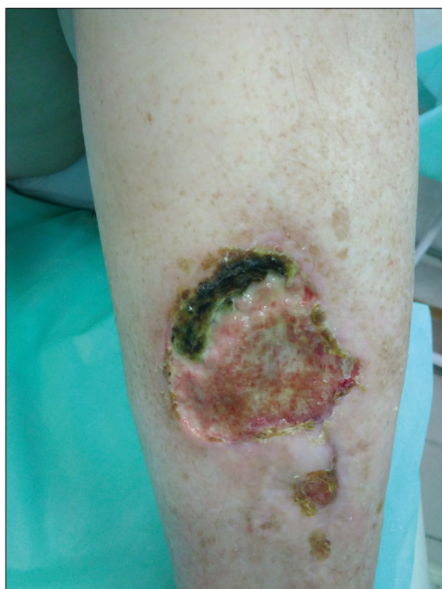
Figure 1. Ulcer in a Patient with Chronic Venous Disease C6 EpAsPr, view at baseline

No statistically significant reduction of the ulcer surface area at the first stage was observed in patients of the 1 st group ( p \geq 0.05 ). Surface area reduction 6 weeks after the treatment has revealed 0 point (no active ulcers) in 28 patients, while in the remaining 4 patients, the size of active ulcers was of 1 point (Figure 1, 2).