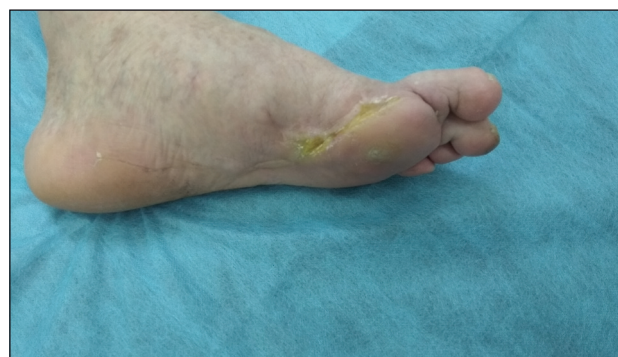
Figure 4. Ulcer in a Patient with Type 2 Diabetes Mellitus, view in 6 weeks after combined treatment

ineffective; especially in diabetes mellitus patients. 25-50% of ulcers of the lower limbs do not heal completely for 6 months, and the rate of non-traumatic amputation reaches 10-15% [13-16].