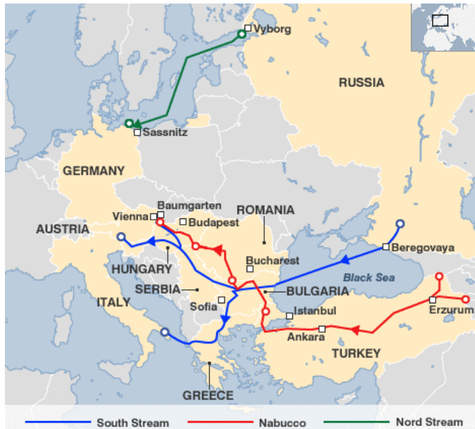
Fig. 1. Projected routes of Nord Stream, Nabucco and South Stream pipelines

turn, Europe who learned from 2009 Russian-Ukrainian energy crisis, is developing an alternative to Russian «streams» projects its own project called «Nabucco», trying to secure itself against Russia’s manipulation with energy resources supply in the future [7].