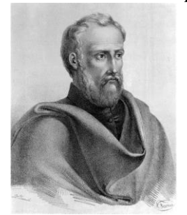
Fig. 2 - Giovanni Battista Canano

important contribution by Canano was the first public demonstration of venous valves performed in 1547 [5, 8].