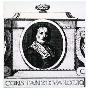
Fig. 4 - Constanzo Varolio

method he was able to observe several structures, including the hippocampus, the cerebral peduncles, and the pons [7, 12, 13]. Varolio rediscovered "Musculi erectores penis" (i.e. mm. bulbospongiosi and ischiocavernosi) and gave a correct description of the mechanisms of erection [14].