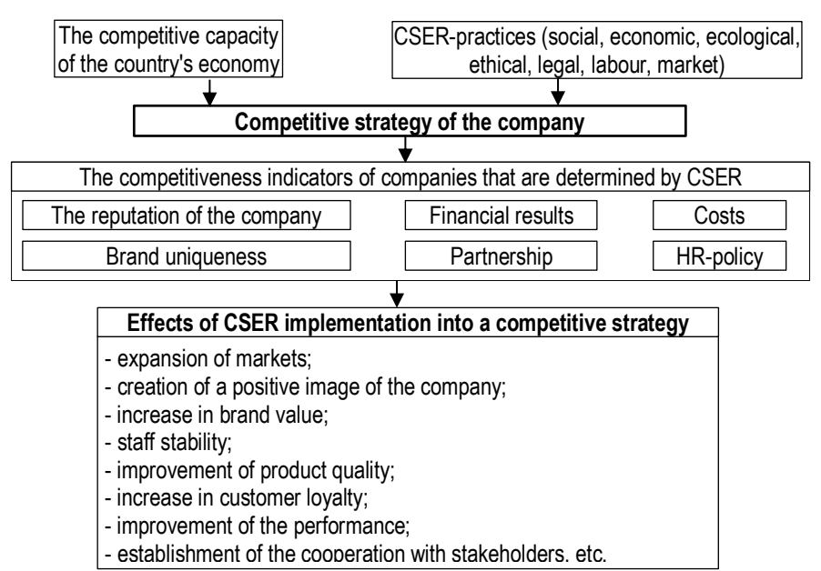
Figure 1. The impact of CSER on the competitiveness of the company as a result of CSER-practices introduction in a competitive strategy