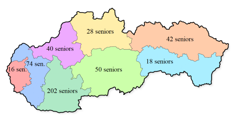
Figure 1. Settlement of respondents according to Slovak districts

Critical value (3,84) had a higher value than test characteristics (0,99). Hence the null hypothesis was accepted, and within 95% probability, this sample reflects the real gender distribution in Slovakia. All respondents have completed at least secondary education, and they live in Slovakia (Figure 1).