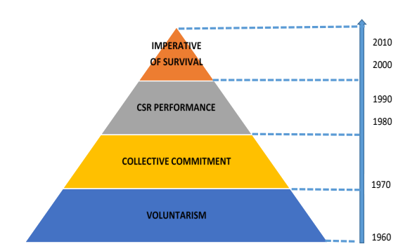
Figure 1. CSR Pyramid adapted to Moroccan context

CSR reporting is a periodical document published by companies to highlight actions and its results in terms of social responsibility. It allows an internal impact by monitoring the impact of their activities on the environment, society and economic ecosystem, and to improve their processes in order to improve results. Second; it allows an external impact by allowing stakeholders better to evaluate the long-term impact of the company activities. However, civil society has an important role to play for the implementation of CSR practices. It is under the pressure of the parties and NGOs that the normative disposals appeared. NGOs characterise the emergence of a genuinely civil society that was progressive as «Balanced Power» between «economics» and «politics» by appropriating a large number of social issues (Queinnec, 2004). This contribution of CSR offers significant influence and give the society a voice to co-regulate the environment (Fransen and Burgoon, 2013). Doh and Guay (2006) highlight the growing role of NGOs and increased participation in national and international debates. The following framework describes the perception of the CSR paradigm according to its decade's evolution (Figure 1).