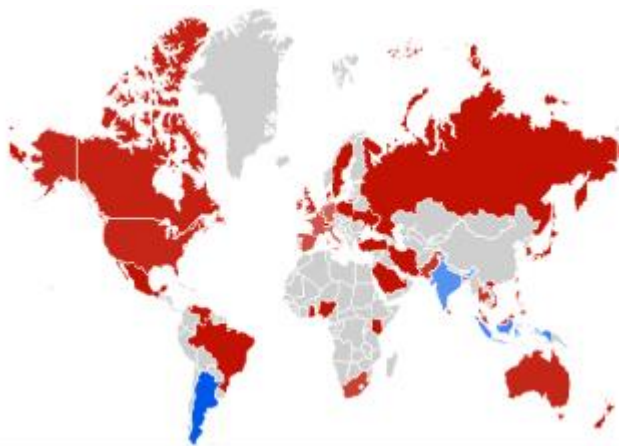
Fig. 2. The level of interest in the concepts of green campus and green university by country [7]

In terms of countries, the results of search queries are presented in Fig. 2. As it can be seen from the color of the picture, the attention of most of the world is focused on the term green university. For example, in Italy, Germany and India, the ratio of inquiries is 50% / 50%, in Singapore, Spain, the Netherlands and Ireland the shift of interest towards the green university — an average of 30% / 70%. In countries such as the United Kingdom, the United States, Canada and Australia, there is almost 100% interest in green universities — 10% / 90% (Fig. 2).