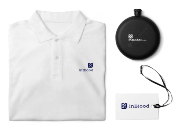
Figure 5. Branded products of «InBlood» (own development)