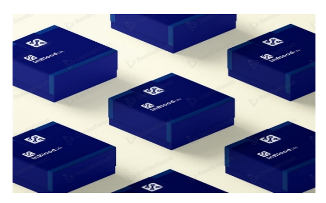
Figure 3. Packaging prototype for «InBlood Life» (own development) Sources: developed by the authors.

It is mandatory to form a brand with a complete visual identity, packaging design (Fig. 3), a reliable image, pages on social networks, own website (Fig. 4), and branded products (Fig. 5).