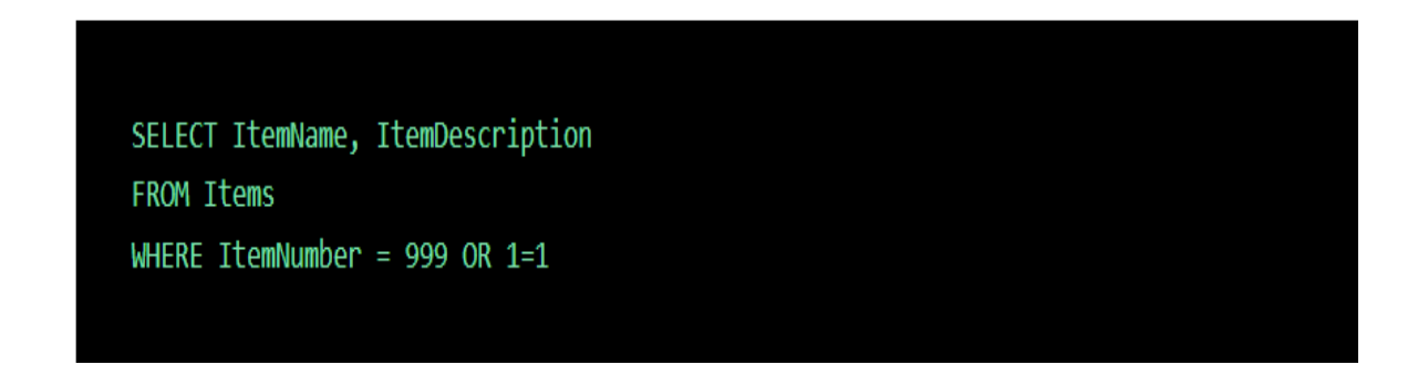
Figure. 2.18 - eStore database query being altered

As a result, in (Figure. 2.18) the corresponding SQL query looks like this: