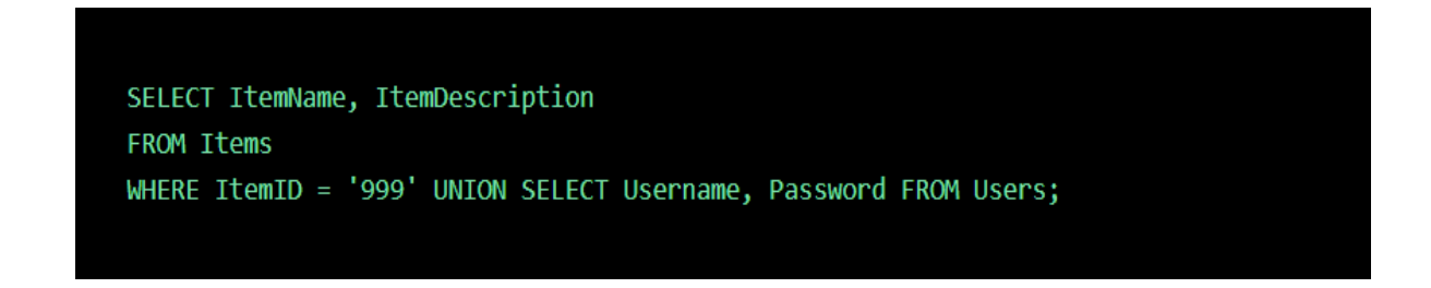
Figure. 2.21 - UNION SELECT statement

input http://www.estore.com/items/items.asp?itemid=999 UNION SELECT username, password FROM USERS produces the following SQL query: