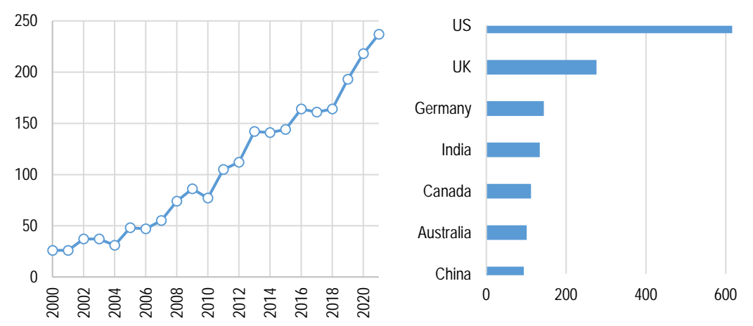
Figure 1. The number of scientific publications devoted to corruption in the health sector

Literature Review. An in-depth bibliometric analysis was conducted to study the publication activity on issues of corruption in the health care system. The scientometric database Scopus was chosen for the study. The following keywords were used to search for scientific publications on the selected issue: «corruption» AND «medic* OR health OR pharmaceut*». The combination of keywords made it possible to identify 2325 scientific articles in the Scopus scientometric database. The dynamics of scientific publications on the studied issues from 2000 to 2021 are presented in Figure 1.