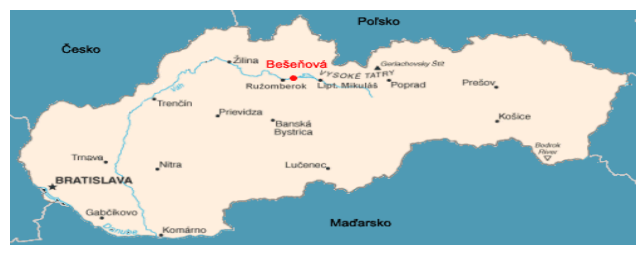
Figure 1. Location of the village Besenova on the map of the Slovak Republic

In the paper is attention paid to the analysis and perception of tourism in the local government of the municipality of Besenova, with an emphasis on the primary and secondary offer of tourism in the municipality, which largely influences the development of tourism in the entire Liptov region. The village of Besenova is located in the heart of the tourist-attractive Liptov region, whose natural diversity ranges from underground cave beauties to high peaks. Thanks to the ideal geographical conditions, the rich culture of folk folklore, or the unique architecture, it is one of the most popular holiday regions in Slovakia. Its location on the map of Slovakia is shown in Figure 1.