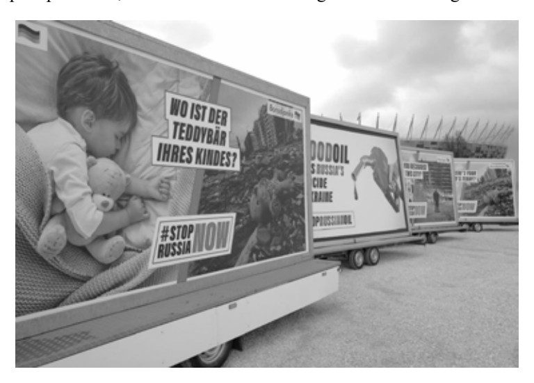
Fig. 2. Prime Minister Mateusz Morawiecki launched a promotional meeting across the EU. Photo: Mateusz Morawiecki (2022) [19]

Prime Minister Mateusz Morawiecki has started "everyone" on billboards across the EU to "build Europe's conscience". He plans to divert the West from economic cooperation with Russia. The prime minister has satisfied the #StopRussiaNow advertising network with Western European politicians, whom he accuses of wanting too fast results in good relations with the Kremlin.