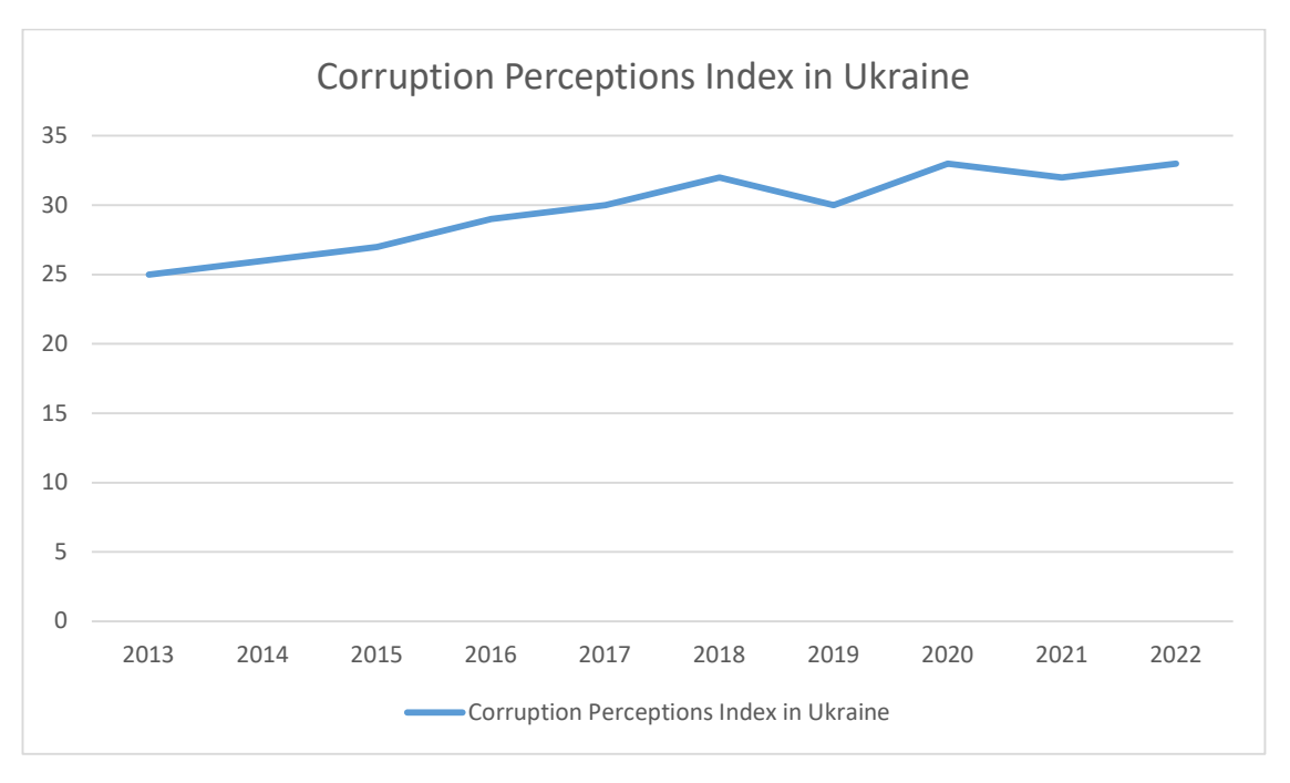
Figure 2.2 – Corruption Perception Index in Ukraine

Source compiled by the author on the basis of [14].