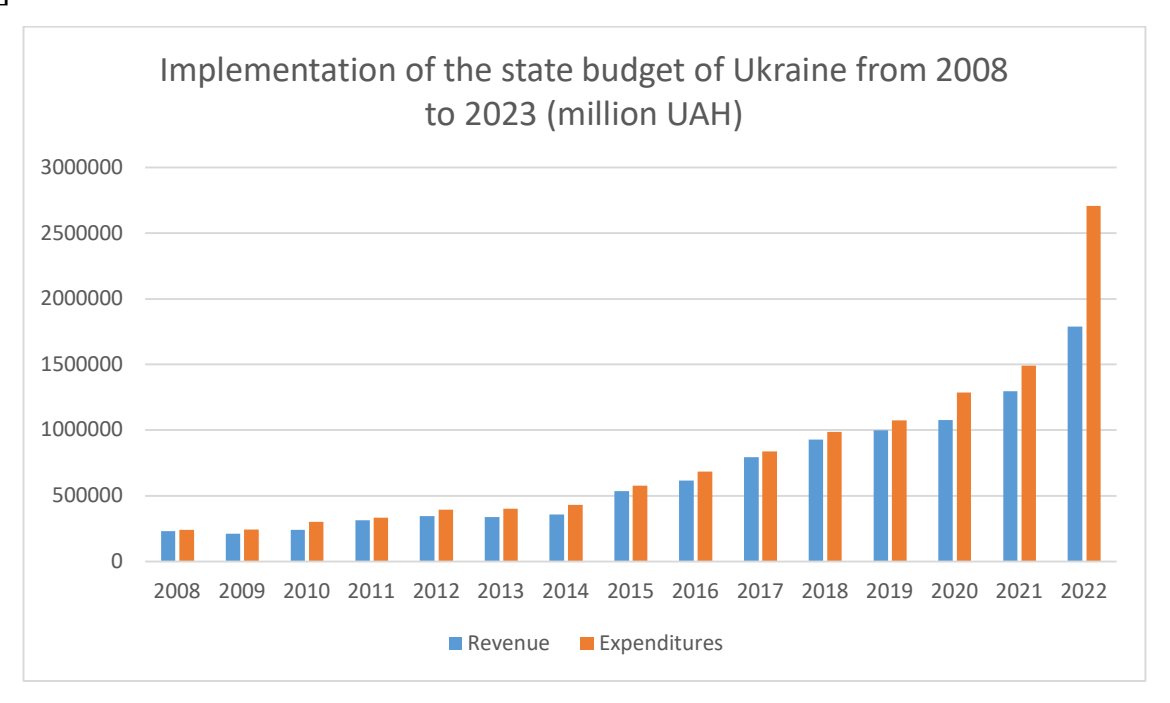
Figure 2.4 – Implementation of the state budget of Ukraine from 2008 to 2023 (million UAH)

state revenues. In 2022, the difference became the largest, reaching –17.69% of GDP. [28]