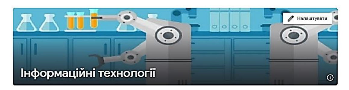
Figure 2 Example of the "Information Technologies" course design

The created class should be configured. Google Classroom provides a variety of templates and classroom theme settings (Figure 2). If necessary, a photo can be uploaded as a theme.