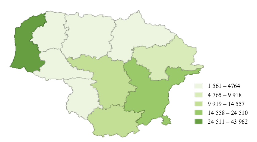
Figure 3. Number of places in accommodation, 2023

At the level of the Republic of Lithuania, there is an increasing trend in the number of places in accommodation establishments from 89 813 (2018) to 121 556 (2023). This growth reflects the dynamism of the tourism sector and the potential development of infrastructure. The capital region, which includes Vilnius County, shows a steady increase in the number of places from 2018 to 2023. The regions of central and western Lithuania are also showing growth, albeit with some fluctuations. The largest number of accommodation places is observed in Klaipeda County. This can be explained by the uniqueness of Klaipeda County as a coastal region. Vilnius County is also characterized by a greater number of accommodation places, attracted by its position as the capital and the largest city of Lithuania, which can offer tourists exceptional attractions related to culture as well as to business and academic activities.